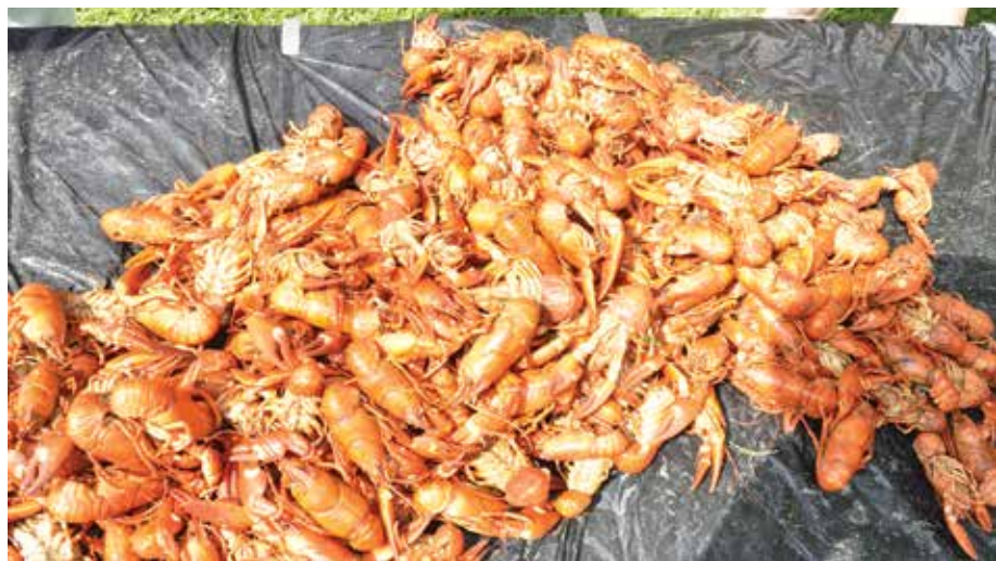
A pile of crawdads.