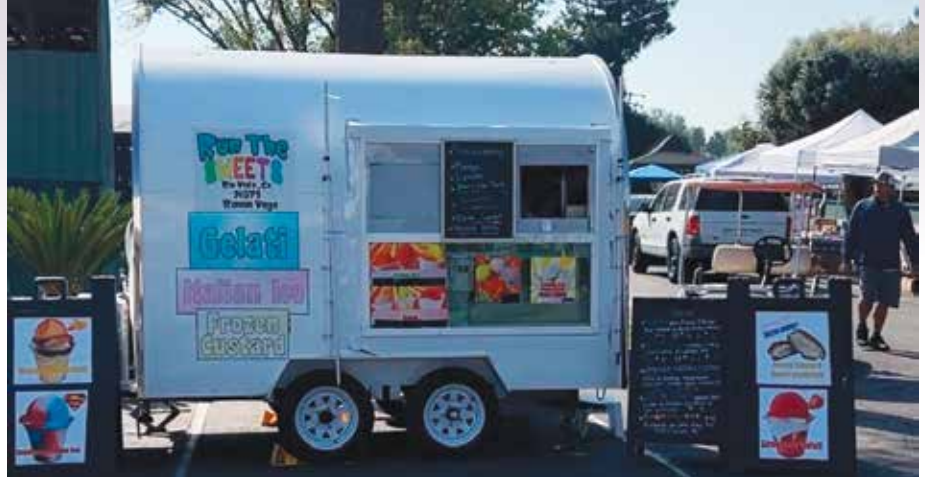
Italian Ice at Willow Berm.