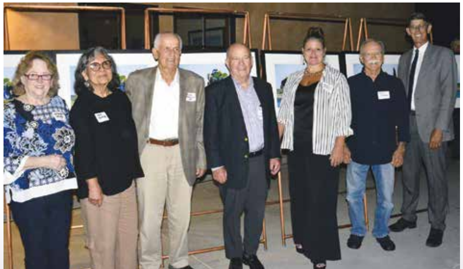
The Leadership Award winners.