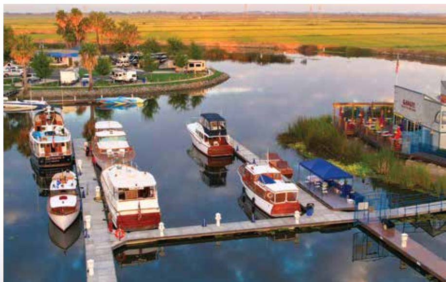
Classics in the morning at Village West.