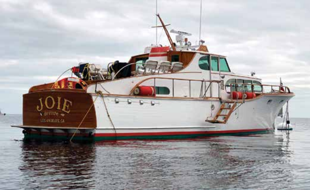
JOIE de vivre moored at Catalina.