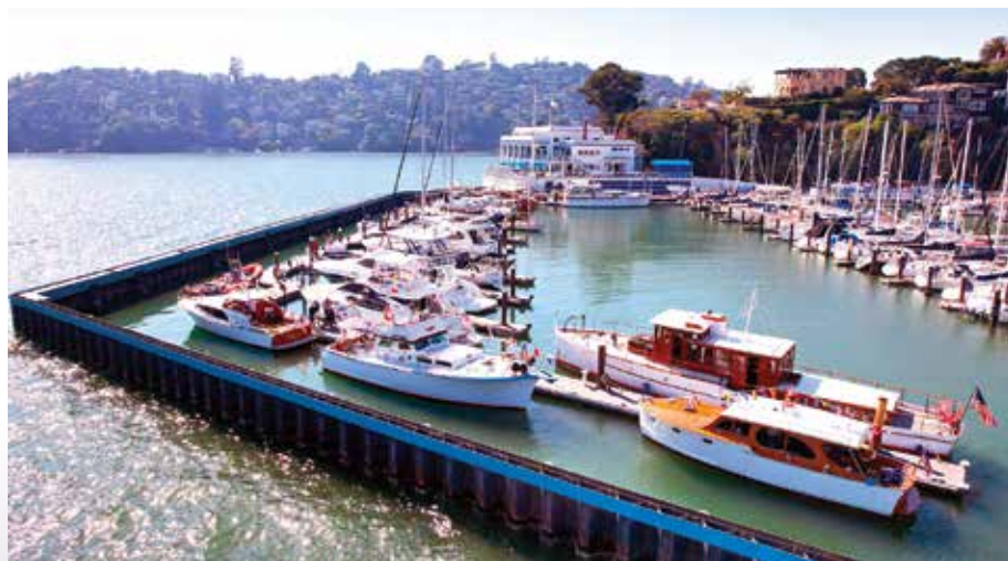
Classic yachts at the Corinthian Yacht Club.

Representative Barbara Lee of Oakland, Rep. Kate Porter of Irvine and Rep. Adam Schiff of