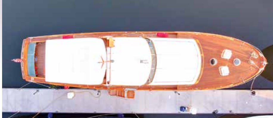
Aerial view of Miss 102.