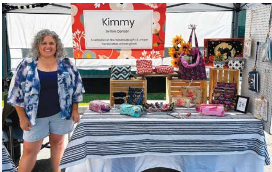
Handmade crafts at Willow Berm.